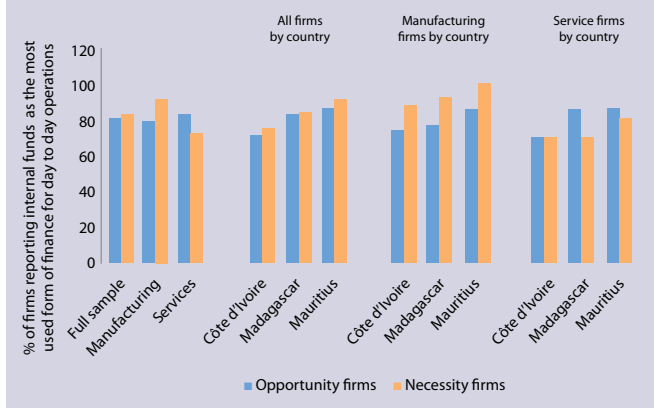
Figure 3 Internal funds are the most used source of finance for the day to day operations of firms